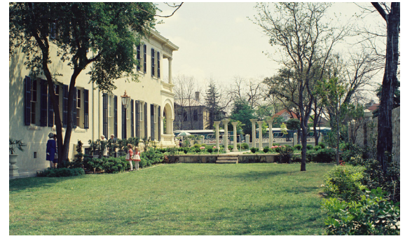
Left: Lower Formal Garden, 1970 Bottom left: Rear garden patio, 1970.

Lower Formal Garden (1971-1985): As the River Walk project expanded behind the property, the view from the Upper Formal Garden to the river was eliminated, thus turning the garden design inward with the addition of this Lower Formal Garden. The gazebo's domed metal top was added to the columns in 1975, and intimate seating areas were added along the stone wall. Stone statuary and metal vases with ferns reminiscent of Mathis' Victorian upbringing were also added.