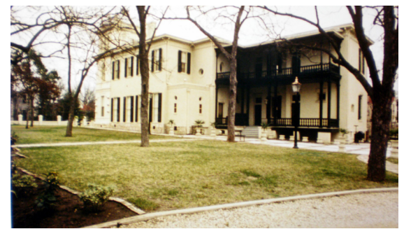
Top right: Example of Villa Finale antique rose, 2008. North Garden, 1970.

Side Garden (1985-1986): Prior to the River Walk extension, Sheridan Street saw very little foot traffic which made the need for privacy in this area unnecessary. But as the home's fame grew, so did the need to screen the property from curious eyes with the hedge-like Baltic Ivy along the fence. The Tool Shed, seen to the right of the driveway entrance, was built just prior to 1986 to shield views of the carport and driveway from Sheridan Street. With the best pecans and live oaks to predate Mathis on this side of the gardens, the area became a relaxing tree-shaded greensward still used for large museum events to this day.