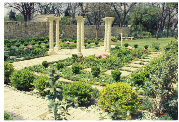
Upper Formal Garden, April 1970.

Upper Formal Garden (1967-1970): The Upper Formal Garden mirrors the house in that this marks the formal entrance to Mathis' grounds. This was the first area Mathis designed in his garden and it is as recognizable in the neighborhood as the home's signature tower. Inspired by simple geometrical "circle in square" designs found in early 19th century Southern gardens, the shapes seem to invite visitors to the open center, the "core." The six columns at the core, which once surrounded the Mathis swimming pool at the Monte Vista property, were transferred here as the focal point to the outdoor retreat.